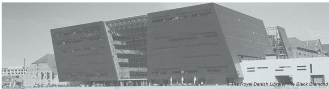
The Royal Danish Library, The Black Diamond